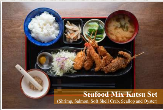
Seafood Mix Katsu Set (Shrimp, Salmon, Soft Shell Crab, Scallop and Oyster)

*Set meals include Rice, Miso Soup, Pickled Cucumber, and Kimpira Gobo