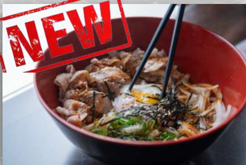
Mixed Soupless Udon Noodle /まぜそば風うどん …… $14.00