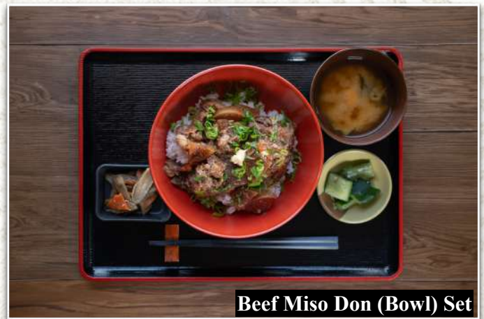
Beef Miso Don (Bowl) Set