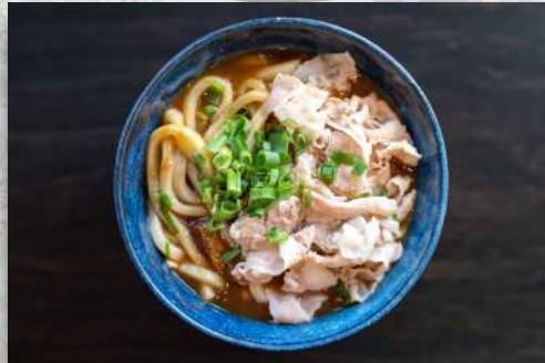
Curry Udon /カレーうどん …… $13.50