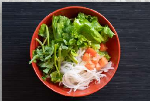
Cold Salad Udon /サラダうどん …… $11.00