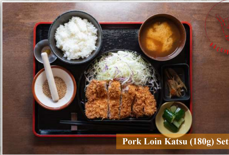
Pork Loin Katsu (180g) Set