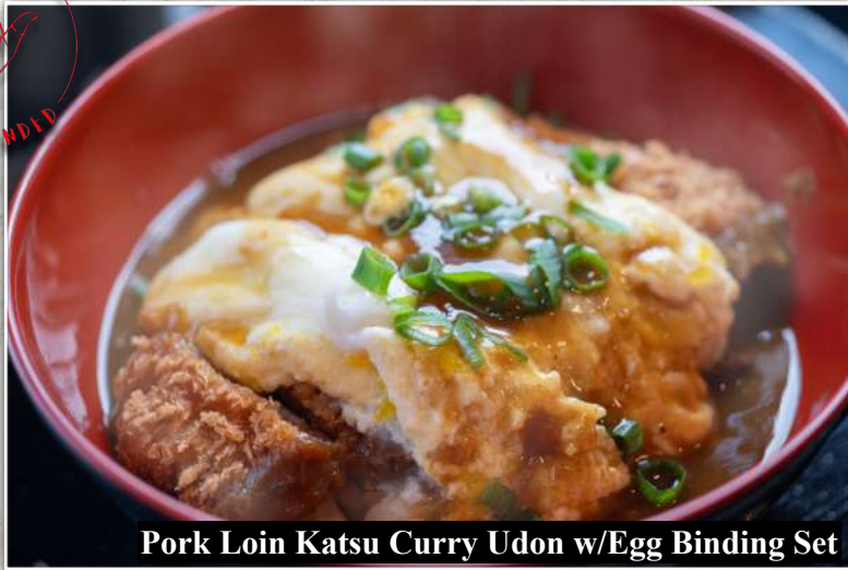
Pork Loin Katsu Curry Udon w/Egg Binding Set