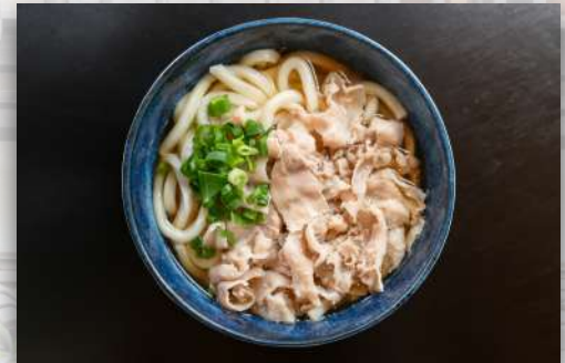
Pork Belly Udon /肉うどん …… $12.00