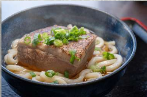
Kakuni (Simmered Pork) Udon /豚の角煮うどん …… $14.00