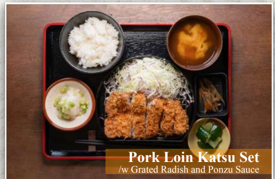
Pork Loin Katsu Set /w Grated Radish and Ponzu Sauce