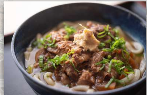
Beef Miso Udon /牛味噌煮込みうどん …… $14.00