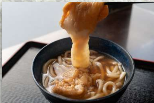
Mochi Udon (Rice Cake Wrapped in Fried Tofu) /餅巾着うどん …… $12.00