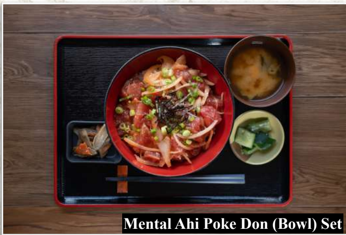
Mental Ahi Poke Don (Bowl) Set