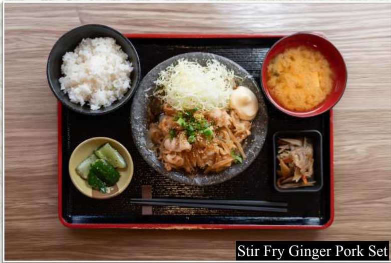
Stir Fry Ginger Pork Set