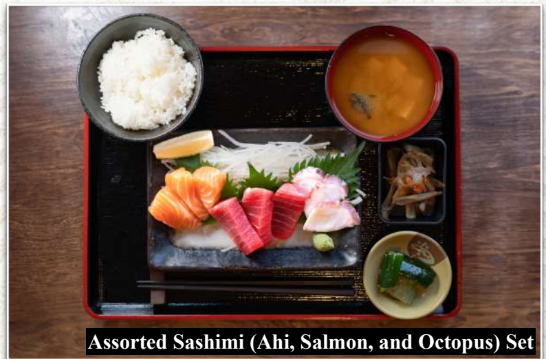
Assorted Sashimi (Ahi, Salmon, and Octopus) Set