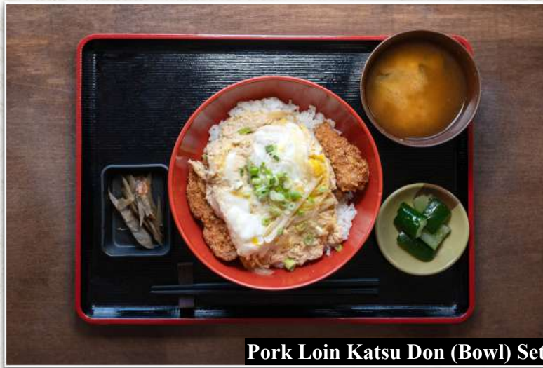
Pork Loin Katsu Don (Bowl) Set