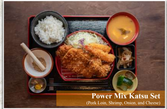
Power Mix Katsu Set (Pork Loin, Shrimp, Onion, and Cheese)