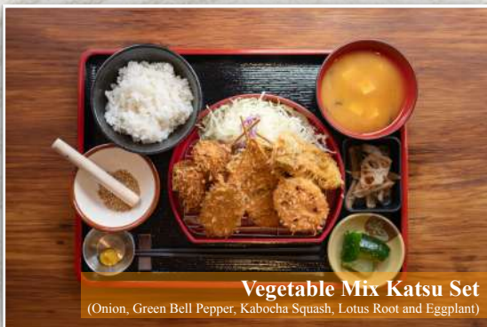
Vegetable Mix Katsu Set (Onion, Green Bell Pepper, Kabocha Squash, Lotus Root and Eggplant)